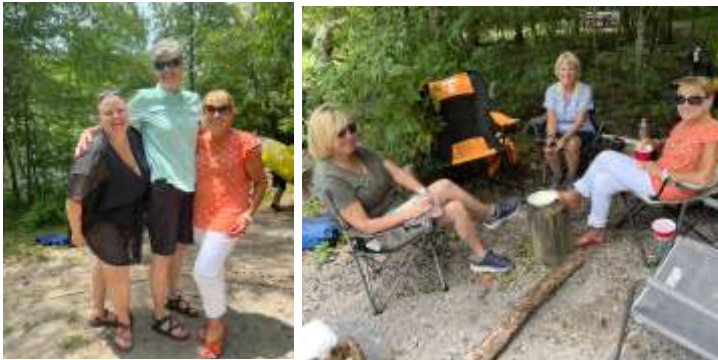
A few of the hospitality crew await the floaters coming down the Hiwassee for lunch at Big Bend.