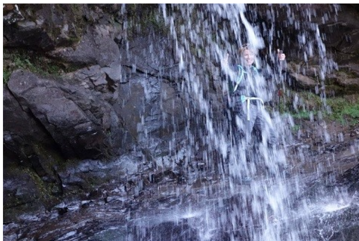
Look close... What a great picture!