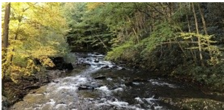
Virginia Creeper pictures from Barbara