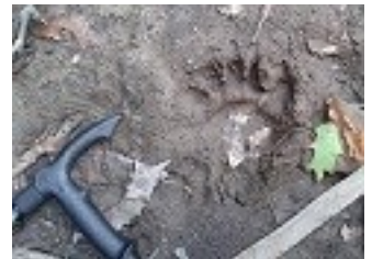
An impressive footprint on the Forney Creek trail