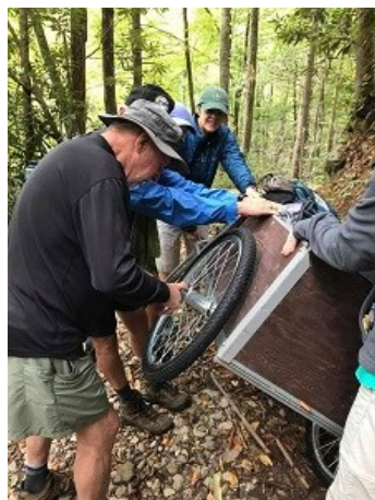
Nobody had a AAA card?