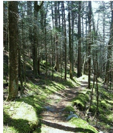
There's no wi-fi in the forest, but I promise you'll find a better connection!